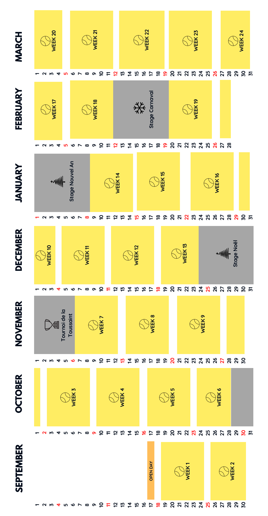
Vacations at the Howald Tennis Club School